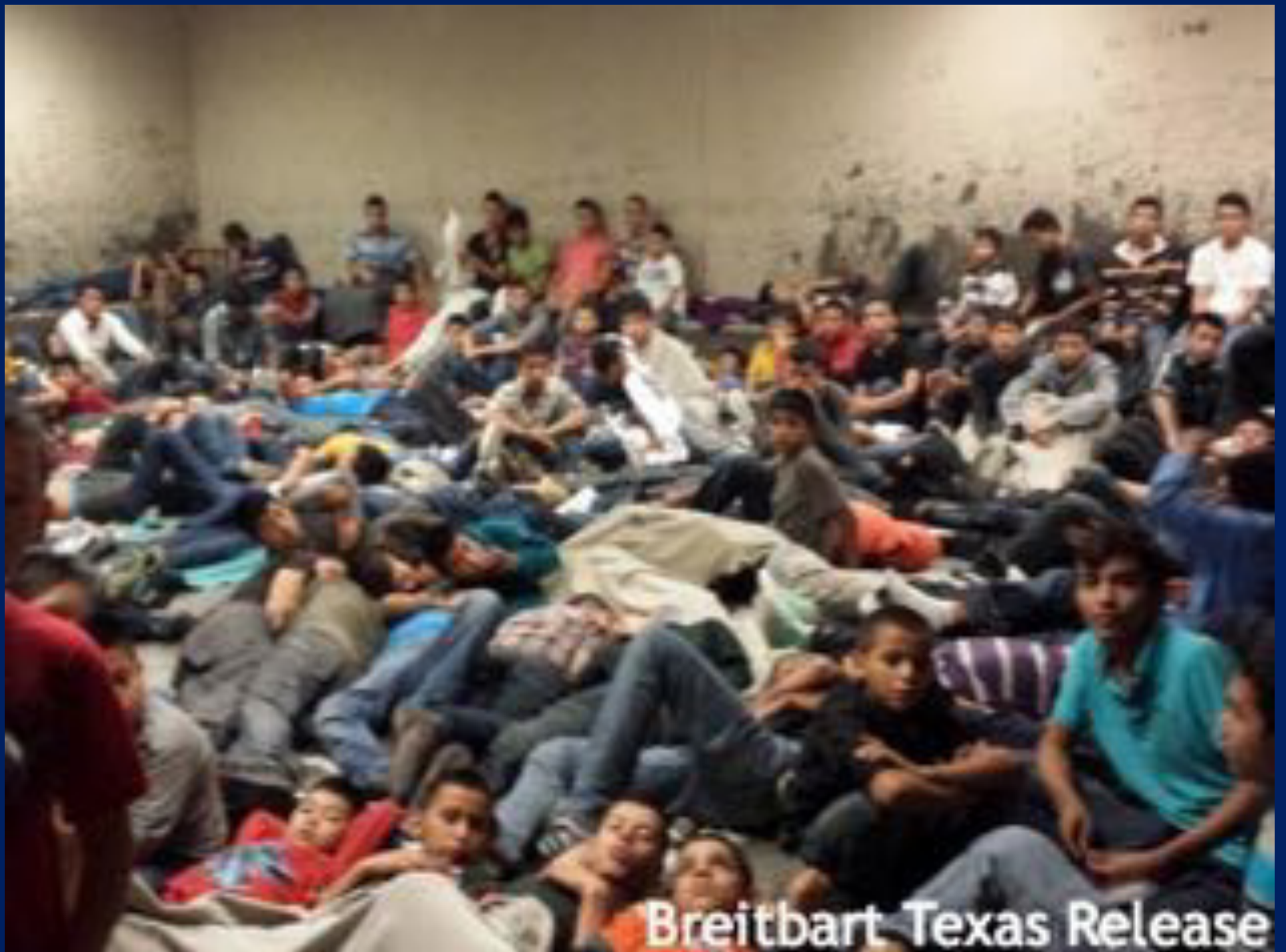
Breitbart Texas Release