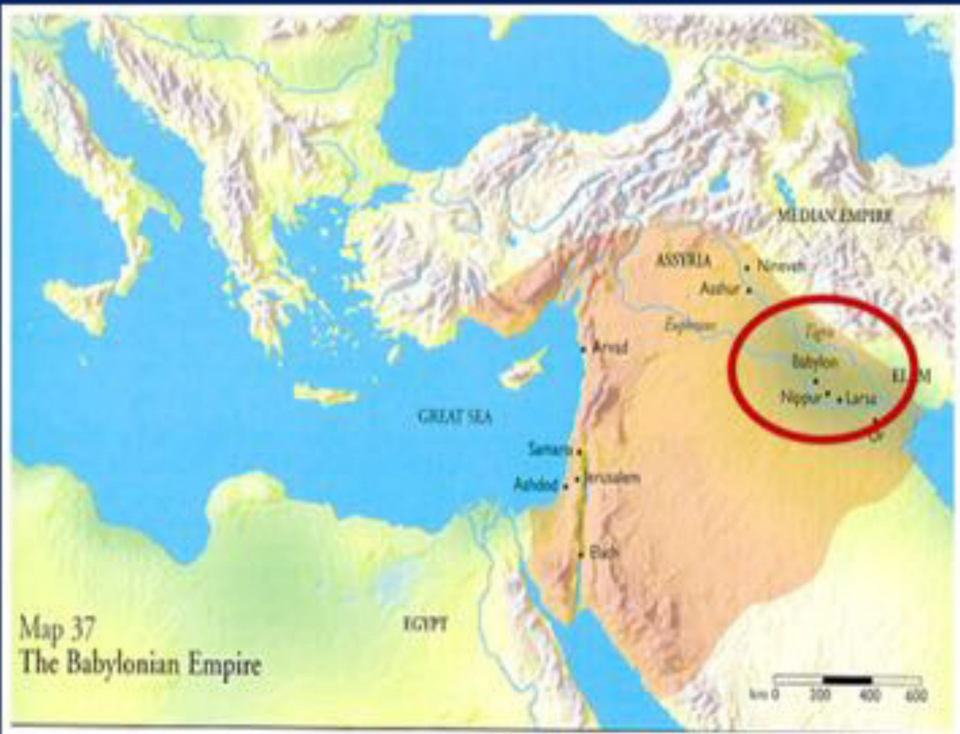
Map 37 The Babylonian Empire