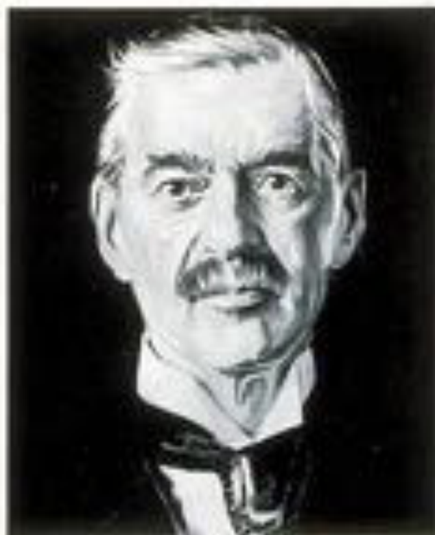
FRANKLIN D. ROOSEVELT AS PRESIDENT OF THE UNITED STATES