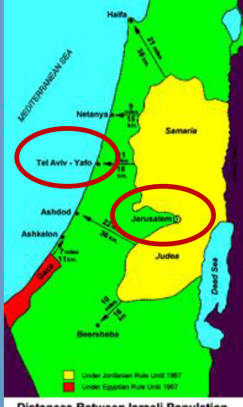
Distances Between Israeli Population Centers and Pre-1967 Armistice Lines