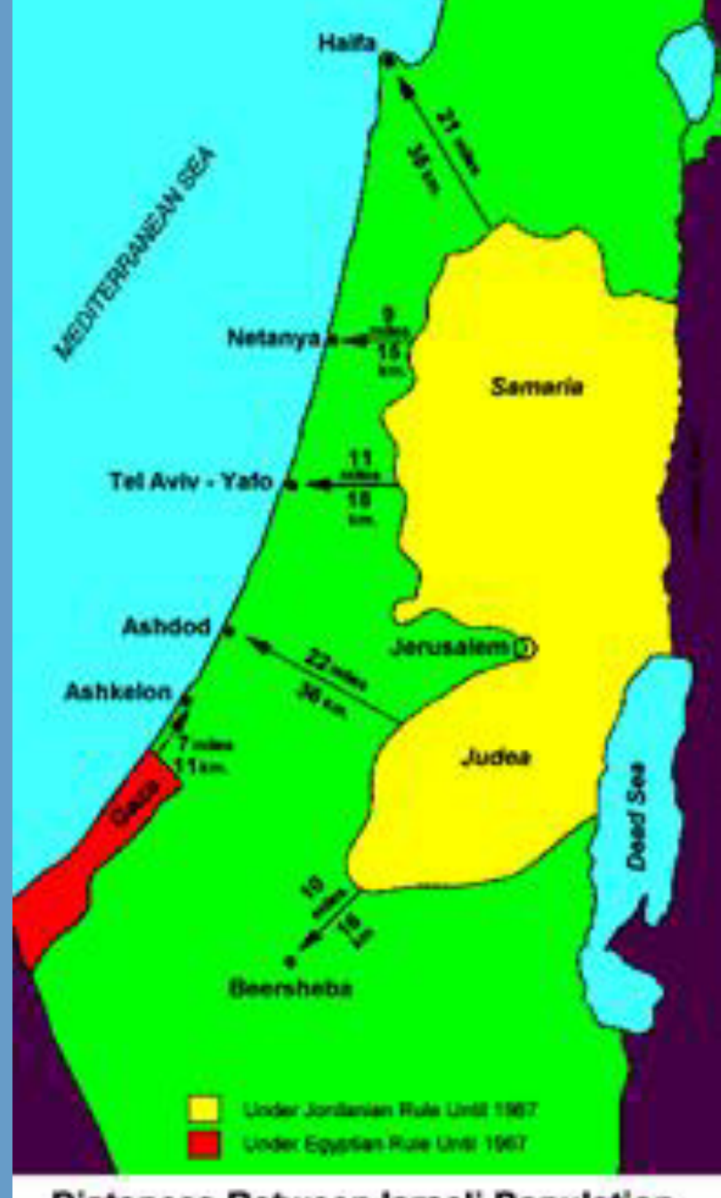
Distances Between Israeli Population Centers and Pre-1967 Armistice Lines