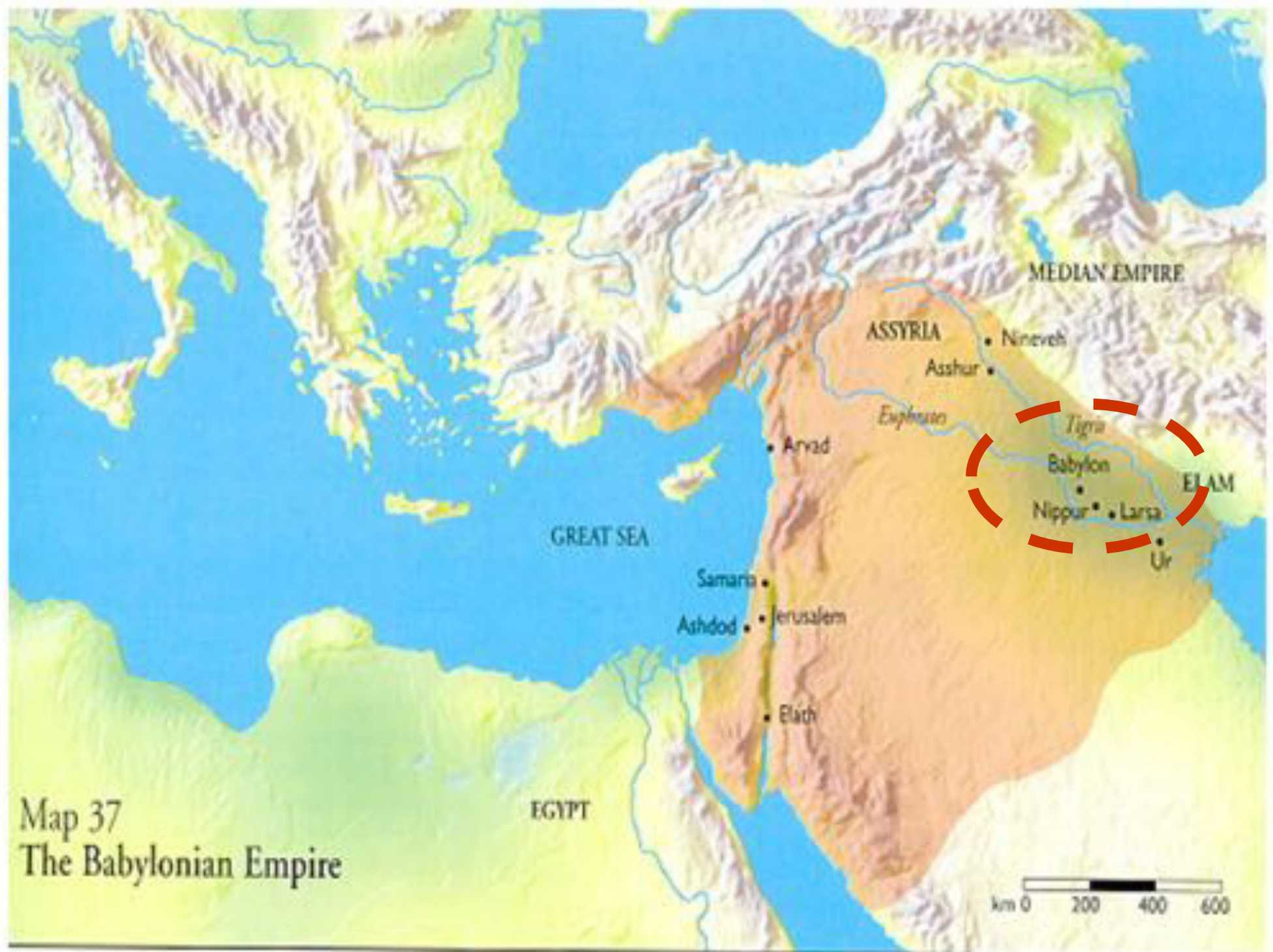
Map 37 The Babylonian Empire