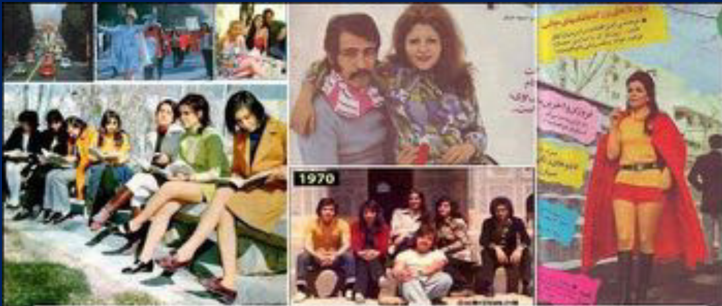
IRAN BEFORE ISLAMIC REVOLUTION