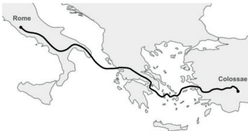
Route map: Rome to Colossae

Let's take a moment to figure out how Paul's letters traveled from Rome to Colossae. In Paul's day it was quite a bit more difficult to deliver letters than it is today. The Roman Empire did have an official postal service, and their system of roads connected all of the far-flung points across the entire empire. Their messenger service was called the cursus publicus and it was a state-controlled courier system. The Roman historian Procopius wrote: "The earlier emperors established couriers throughout their dominion. At a day's journey for an active man they fixed stages, and in every stage there were forty horses and a number of grooms in proportion. The couriers often covered in a single day as great a distance as they would otherwise have covered in ten." This sounds simi-