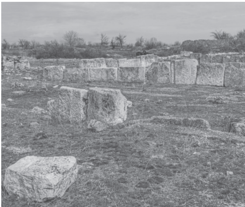
Building stones scattered in the ruins of the ancient city of Colossae.

been taken from the ancient site and put on display.